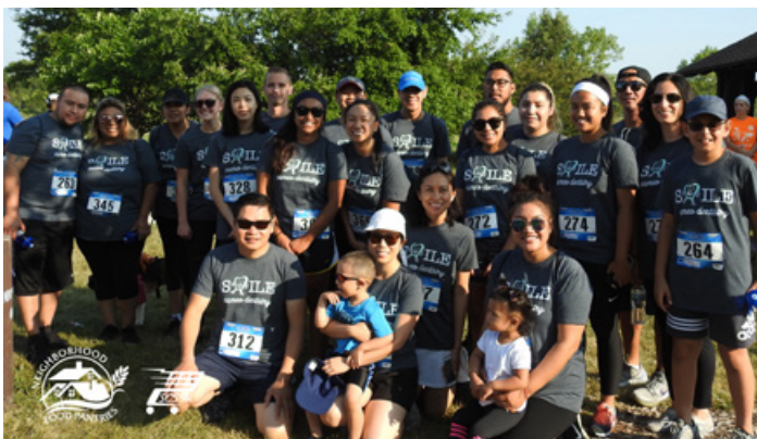
Cameo Dentistry is both the lead sponsor and largest fundraising team at our annual Shopping Cart Shuffle 5K.