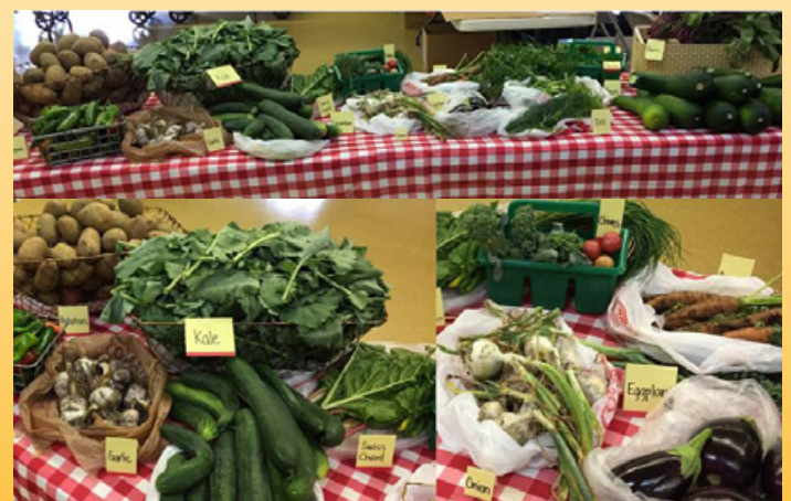
The St. Isidore Organic Garden provides fresh produce to our pantry at Resurrection.