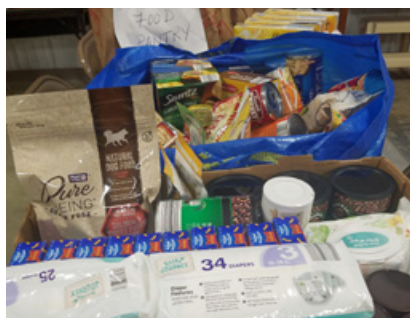
The Glendale Heights Police Department wives made a generous donation.