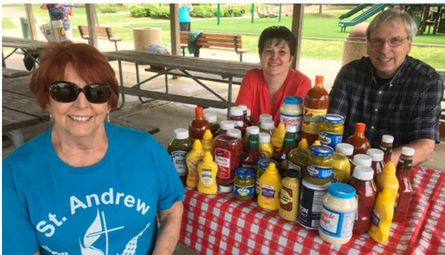
The St. Andrews United Methodist Women turned their annual picnic into a "Picnic with a Purpose", collecting condiments for our pantries!