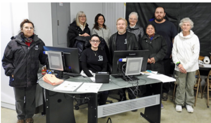
Members of Family in Faith volunteer at their new pantry.