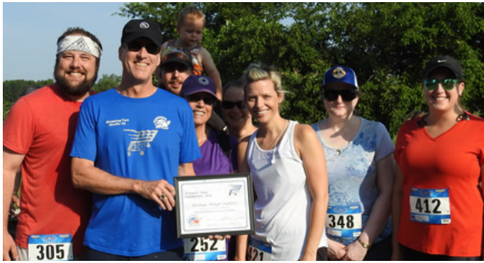
The Heritage Hunger Fighters were the 3rd largest fundraising team at our annual Shopping Cart Shuffle 5K.