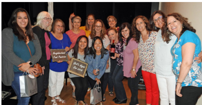
Mario Tricoci Salon hosted our 2nd annual Girl's Night Out event donating spa services to our guests!