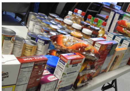
Weekly pickup of items collected from parishioners of St. Isidore Parish.

Resurrection Girl Scouts Sauer's Bakery Spotlight Theater St. Andrew United Methodist Church St. Andrew Lutheran Church St. Athanasios St. Francis High School St. Isidore Church St. Michael UCC- West Chicago State Bank - West Chicago SummerLakes Sysco Target The Farm Thrivent Financial Trader Joes - Bartlett Trinity Lutheran - Warrenville Village of Carol Stream West Chicago VFW Women's Auxiliary Wellspring Warrenville West Chicago Library