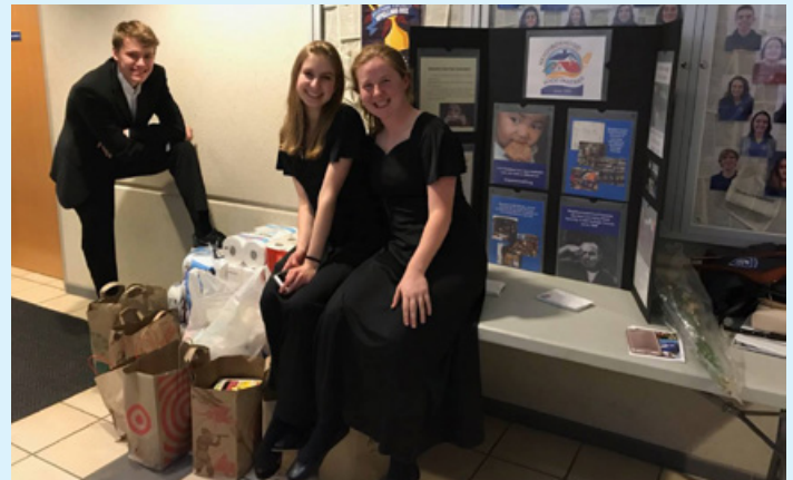
St. Francis HS choir collected canned goods as admission to their concert.