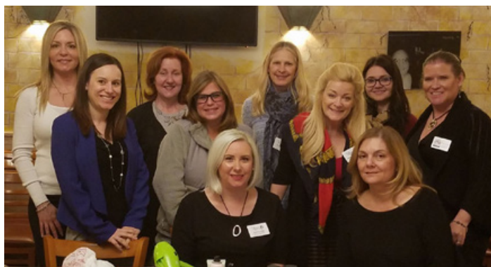
The Dynamic Professional Women's Network Bloomingdale/Addison collected women's products for our pantries.