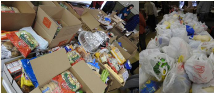
Parishioners at Resurrection Catholic Church donate Thanksgiving boxes & turkeys for our pantry guests.