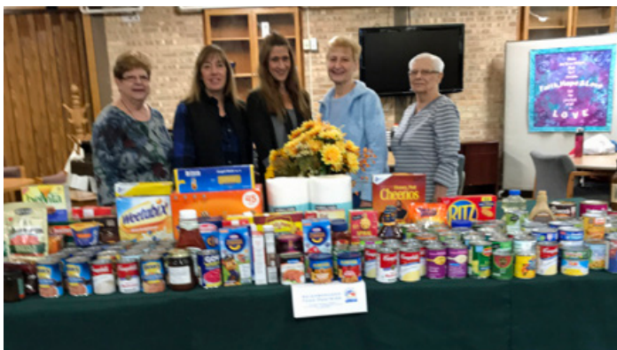
Charter Fitness holds an annual Thanksgiving food drive for our pantry at Lutheran Church of the Master.