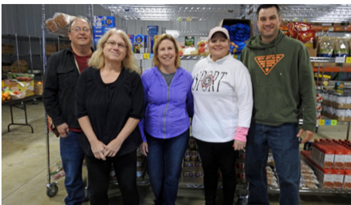
Wheaton Bible Church's "Singles Group" sends volunteers to our new pantry at Family in Faith.