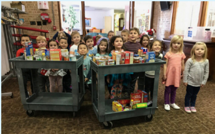
The preschool at Lutheran Church of the Master collected items to contribute to this year's Thanksgiving baskets for our guests.