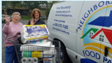
Glenbard North HS collected toilet paper as part of their Homecoming festivities. "Don't throw it in the trees - give it to your neighbors in need!"