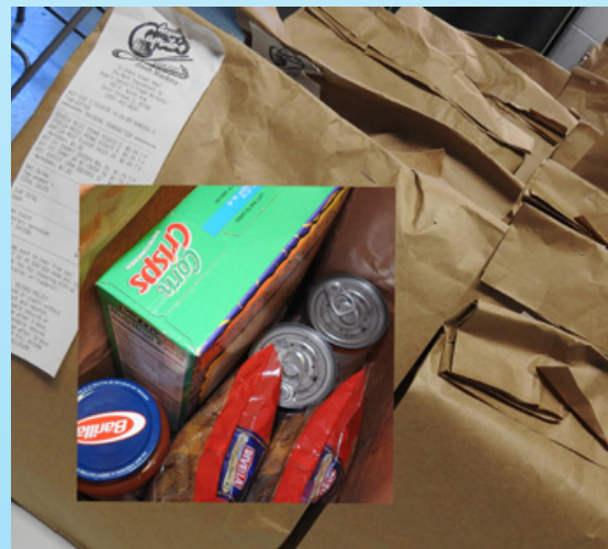
Grocery bags full of items purchased with donations from customers of Angelo Caputo's Fresh Markets.

Aldi - Carol Stream Aldi - Glendale Heights Aldi - West Chicago Aldi - Wheaton Caputo's - Addison Caputo's - Carol Stream Chiquita Costco - Bloomingdale Fresh Market - Carol Stream Imperial Foods - Glendale Heights Jewel - Carol Stream Jewel - Lombard Jewel - St. Charles (Kirk Rd.) Jewel - West Chicago Mariano's - Bloomingdale Mariano's - Naperville Pleasant Hill Cares Milk Sauer's Bakery Standard Market Supermercado Tampico - West Chicago Target - St. Charles Trader Joe's - Bartlett Ultra - Wheaton Walmart - Glen Ellyn Walmart - St. Charles